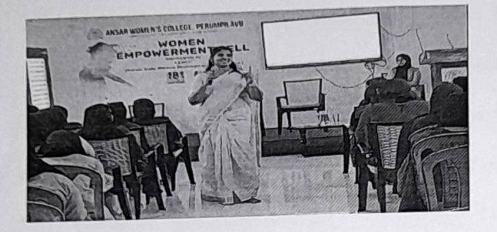
Women Safety Self Defence Training Program

advancement. The session delves into the psychological barriers faced by girls in their pursuit of equality, focusing on a session designed to raise awareness and empower female students.